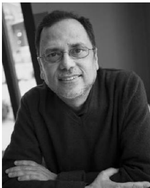
Professor Dipesh Chakrabarty, Lawrence A. Kimpton Distinguished Service Professor of History, South Asian Languages and Civilizations, and the College The Department of History The University of Chicago Chicago, USA

www.ajeelghar.com ; https://marg-art.org/product/UHJvZHVjdDo1MTI0